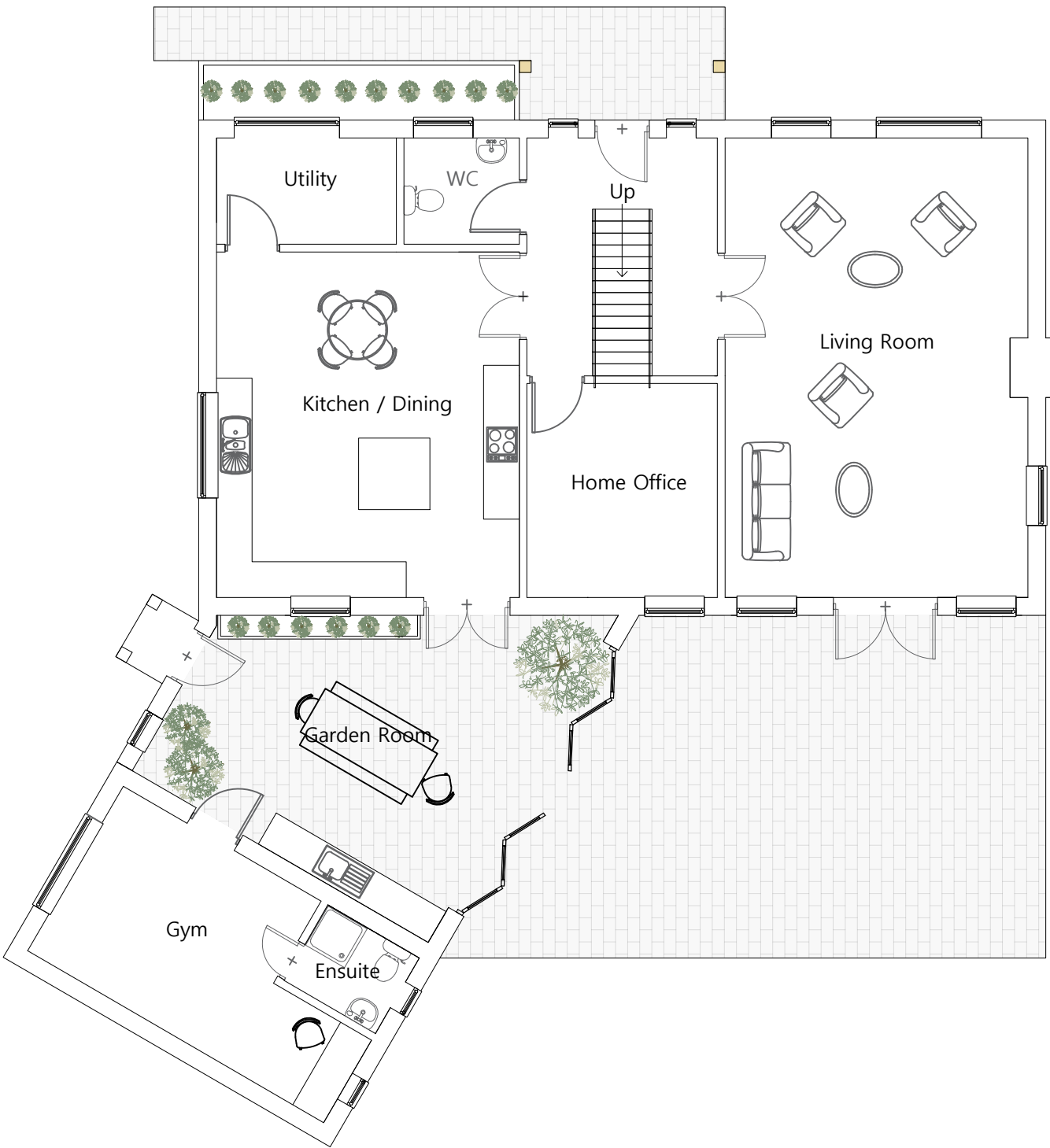
Proposed Ground Floor Plan